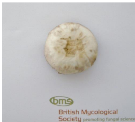
Place your mushroom face down on the card and cover it with a bowl.